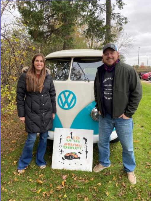
2020 Best in Show 1965 VW T2 Sundial Westfalia

$10.00 Pre-registration (by Sept. 24th) $15.00 registration Day of Show Announcements & DJ by 3-D Sound